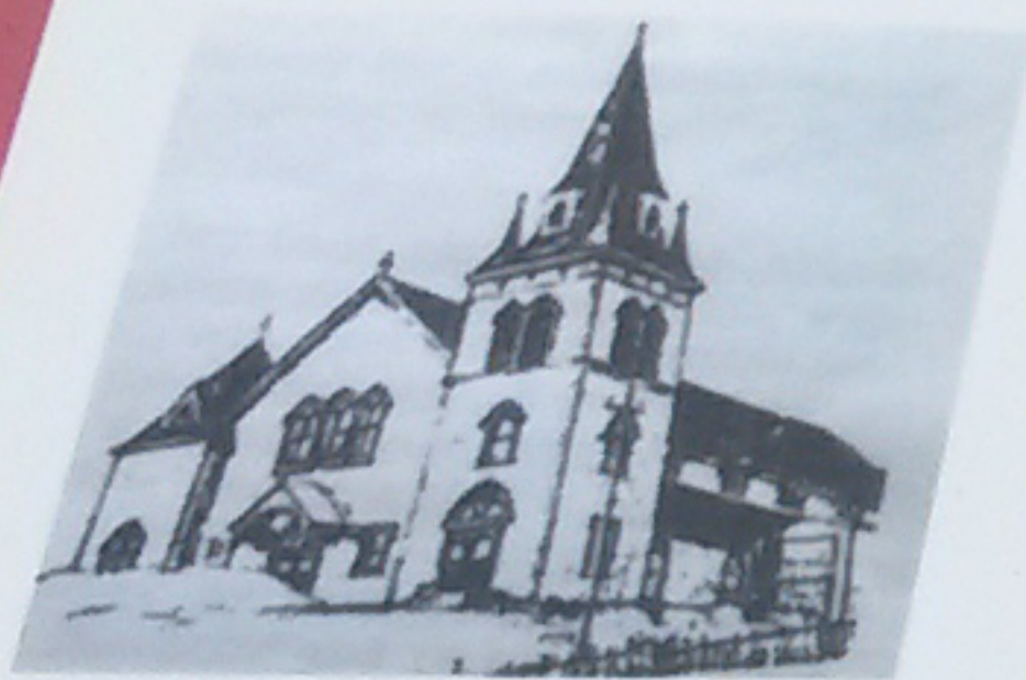
The Central Methodist Church as it was originally constructed.