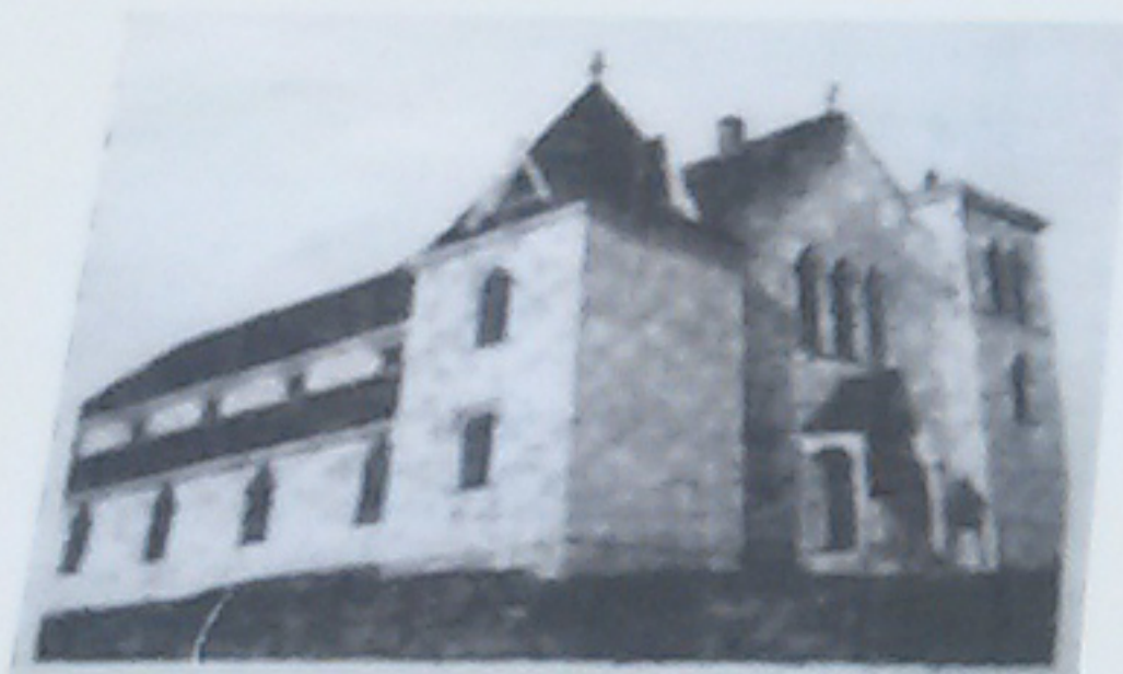
In 1941 the tall stately tower was lowered and in 1974 both towers were removed.